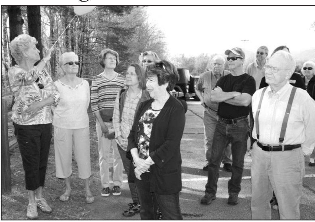
A Blooming Affair' kicked off with the season opening on Saturday, April 15.

that was extremely apparent at the dedication Saturday morning.